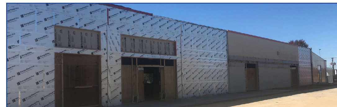
Above: Architectural rendering of new shop. Left: Renovations continue at the new shop location at Pepperwood Plaza, 851 Highway 6 East in Iowa City, the former Kmart building.

Stay tuned to Facebook for the latest relocation updates or email crowdedcloset.volunteer@gmail.com to receive weekly email updates.