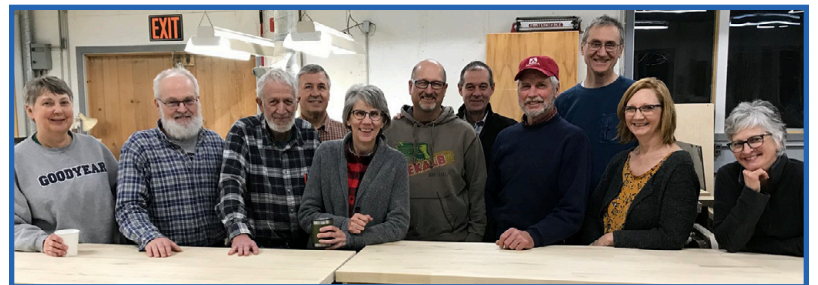
Volunteers build the new sales counter for Pepperwood shop.

Volunteer to help us relocate. Visit http://tiny.cc/OnTheMove to join move activities. New projects are added each week until Grand Opening.