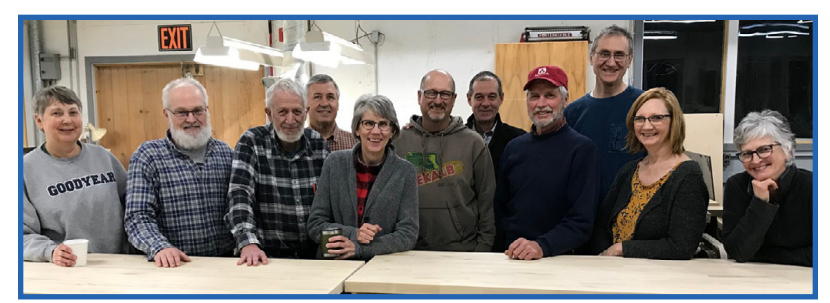
Volunteers build the new sales counter for Pepperwood shop.

Bring your donations to our new donation drop-off at Pepperwood Plaza beginning February 22. We need a large amount of donations to stock the Pepperwood shop for our Grand Opening.