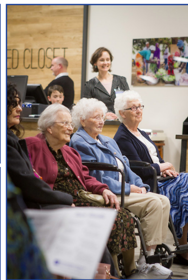
Crowds celebrate shop Dedication Service and Grand Opening.